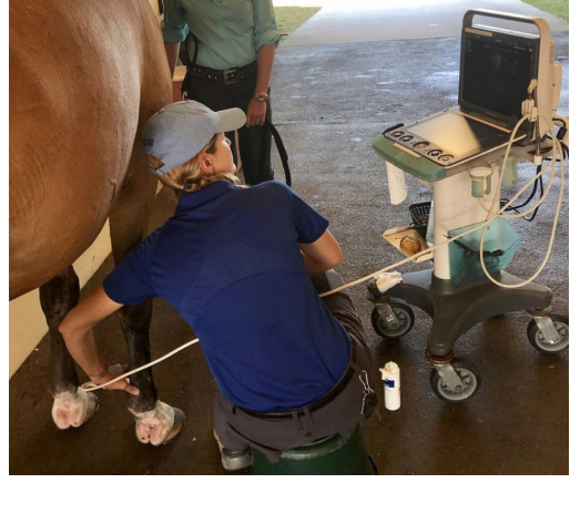
Ultrasonography is often used to diagnose tendon, ligament, and joint issues.

Palm Beach Equine Clinic is equipped with advanced diagnostic imaging modalities that enable our doctors to make precise and timely diagnoses. Diagnostic images are held to the highest quality standards and evaluated by our board-certified radiologist Dr. Sarah Puchalski . With leading diagnostic tools in our arsenal, Palm Beach Equine Clinic is able to identify and treat a wide variety of conditions.