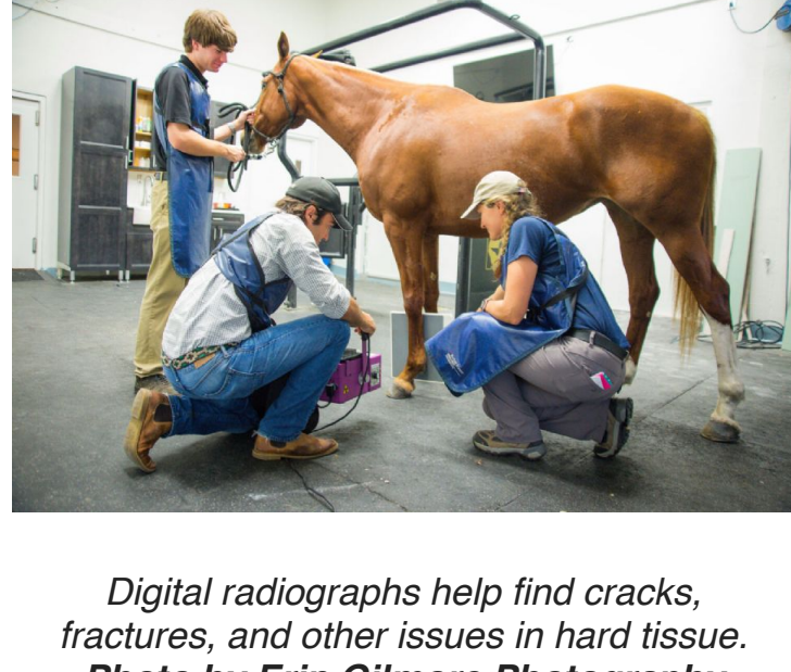
Digital radiographs help find cracks, fractures, and other issues in hard tissue.

Ultrasonography: Ultrasonography is a frequently used, noninvasive, and versatile tool that allows veterinarians to visualize a variety of internal structures and make a swift diagnosis. Ultrasonography uses high-frequency sound waves to produce a real-time image of musculoskeletal structure and internal organs. It is most often utilized to diagnose tendon, ligament, and joint issues, as well as respiratory and cardiac diseases, colic, and pregnancies.